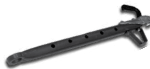
Reversible ball coupling and draw eye