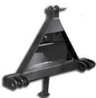
Three point hitch bracket